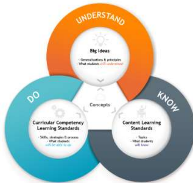
Figure 1. "Know-Do-Understand" model (B.C. Ministry of Education, 2023)

Aligned with the "Know-Do-Understand" model (Figure 1), all learning areas in the curriculum follow a concept-based, competency-driven approach. This model seamlessly integrates Content (Know), Curricular Competencies (Do), and Big Ideas (Understand) to cultivate profound learning experiences. The Content standards specify fundamental subjects and knowledge areas relevant to each grade level. Curricular Competencies, focusing on skills and processes, progress within the Know-Do-Understand model, intricately linked with the Core Competencies. Big Ideas encapsulate generalizations and crucial concepts, representing the "Understand" element. These enduring ideas go beyond a single grade, fostering future comprehension. British Columbia's curriculum design advocates for a personalized, adaptable, and innovative educational approach across all education levels.