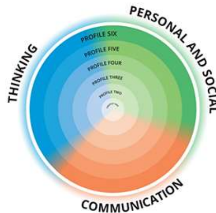
Figure 2. Three Core Competencies (B.C. Ministry of Education, 2023)

Core Competencies, integral to the curriculum, are acquired through active participation in practical applications, termed Curricular Competencies, within specific learning domains. Despite unique traits, these competencies intertwine, forming foundational elements across education. Emerging from early childhood and home environments, their development spans a lifetime, nurtured in formal and informal settings. Progression entails demonstrating competence in supported situations, evolving into independence in complex scenarios. Crucially, competency development transcends school years, permeating personal, social, educational, and professional realms post-graduation, underlining their enduring relevance in diverse life contexts.