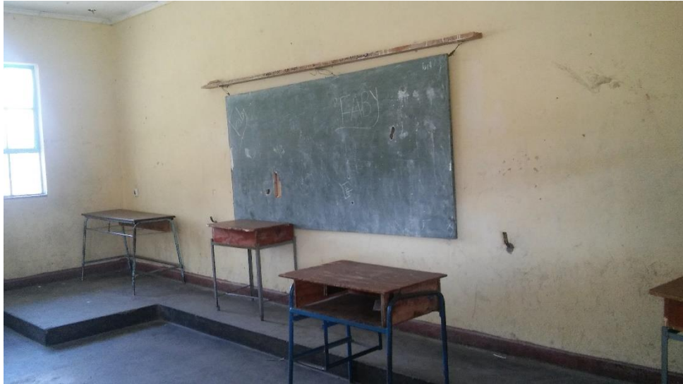
Figure 2. Chalkboard (blackboard) with holes used at one of the schools

The chalkboard shown above has holes and is hung with wire on a plank nailed to the wall. The teacher who took me to the classroom stated that he asked to have the chalkboard and children's desks replaced. He also stated that he asked the administrators to repair the doors to one of the classrooms but was ignored and labeled "a nuisance" and an "attention seeker."