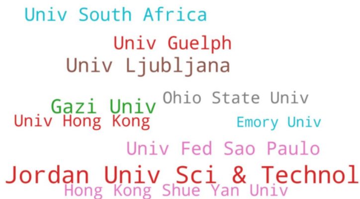
Figure 4. Word cloud graph of energetic research institutions

Each author featured in the publications is affiliated with an institution. ScientoPy also utilises this information in its processing. Researchers are aided in selecting research stays or enrolling in one of their academic programmes or research projects when they can find the most representative institutions in the field. This study confers prestige on the institutions and encourages others to continue writing to acquire an exceptional standing. Figure 4 is a word cloud depicting the ten most prolific safety knowledge publishing institutions. Considering Figure 4, the greater the institution's size, the greater its number of publications. The current study revealed that Jordan University of Science and Technology in Irbid, Jordan led the top 10 institutions with nine publications. Next on the list were Gazi University in Turkey and the University of Ljubljana in Slovenia, each with six publications.