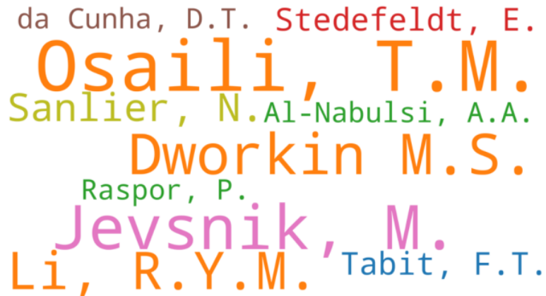
Figure3. Word cloud graph of proactive authors