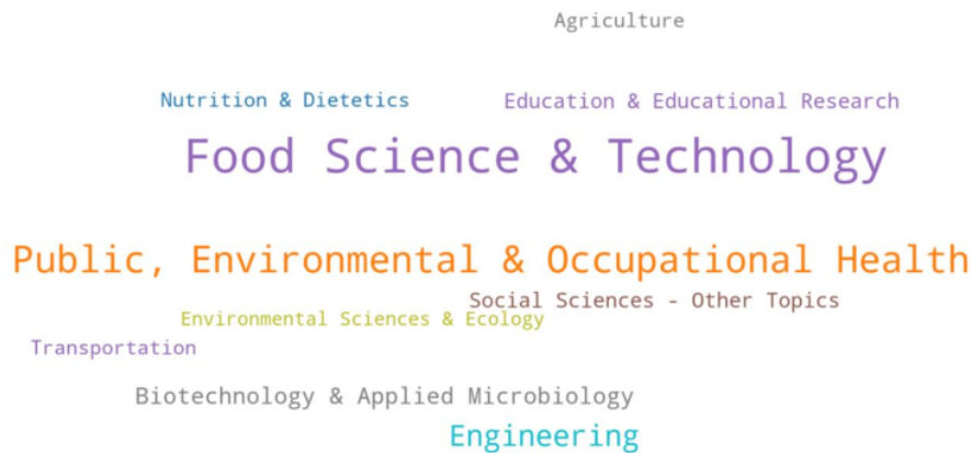
Figure 2. Word cloud graph of subject areas

accidents. Liu et al. (2020) found that safety knowledge strongly mediates the causative association between Occupational Health and Safety Management Frameworks (OHSMF), workplace accidents, and injuries. Also, the authors discovered that safety training is a strong predictor of safety knowledge, work-related injuries, and workplace accidents. Therefore, government and industry players should invest in frequent safety training and orientations to increase worker safety understanding.