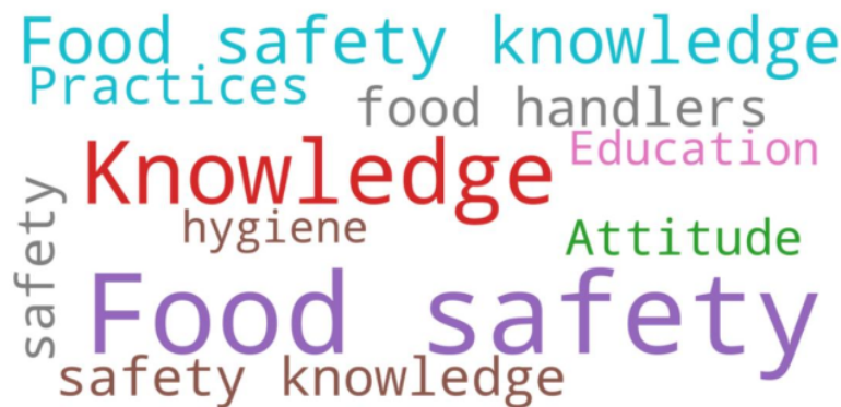
Figure 5. Word cloud graph of the top ten authors' keywords

Figure 5 displays ten keywords from prior studies. As seen in Figure 5, the larger a keyword's magnitude suggested a more significant number of articles. In 124 documents, the keyword "Food safety" appears most frequently in this analysis. The second most prevalent term is "Knowledge", which appears in 72 publications. In third place is the keyword "Food safety knowledge", which has been utilised in 35 articles. Based on the results, it is crucial to recognise that knowledge, food safety, and food safety knowledge are fundamental to studying the context of safety knowledge. These factors may explain why epidemiological data indicate that households are the most common reported sites for foodborne outbreaks worldwide (Jovanovic et al., 2022). Moreover, according to Wan Nawawi et al. (2022), foodborne illness is one of the greatest threats to public health, but it can be circumvented by upholding food safety practices. Thus, to maintain food safety, it is essential to have safety knowledge regarding the proper handling, preparation, and storage of food.